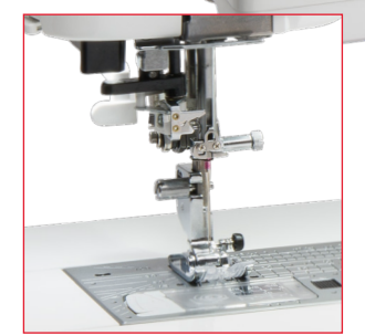
Superior Needle Threader & Improved Sewing Field View