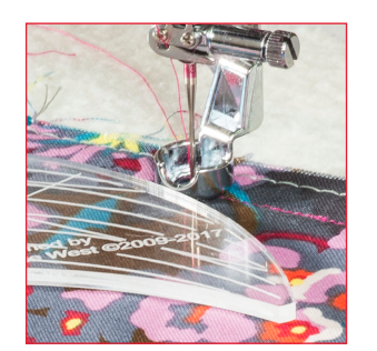
Ruler Quilting Function