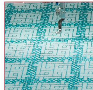
Built-in Sashiko and Wedding designs