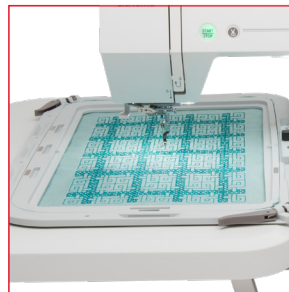
Maximum Embroidery Size: 7.9" x 14.2"