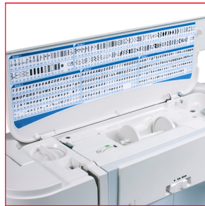
120 Stitches with 1 Alphabet