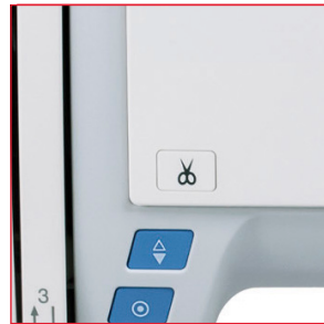
Automatic Thread Cutter