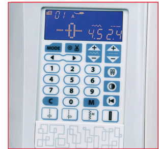
Backlit LCD Screen with Easy Navigation