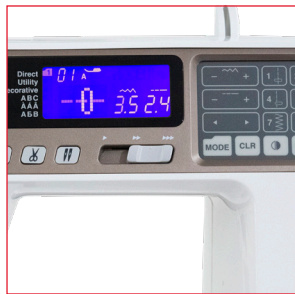
Easy Navigation and LCD Screen