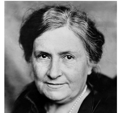
Dr. Maria Montessori Founder of the Montessori Method of Education

Montessori education should not be chosen just because parents are seeking an alternative to the traditional classroom. Parents should choose Montessori because they believe in this approach. Please take time to understand the method, the environment, and how your child will need your support at home to thrive.