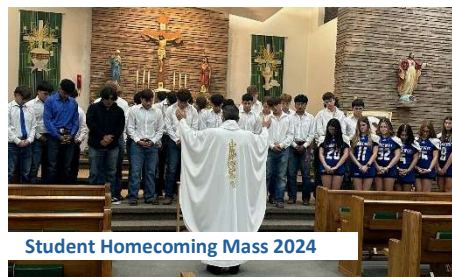
Student Homecoming Mass 2024

Mass is for everyone!!! Please come help us celebrate all our students and teachers throughout the school year!! If you wish to sponsor a breakfast meal for one of the above dates, please reach out to Aubrey Bird @ 361-244-2695 or contact the parish office.