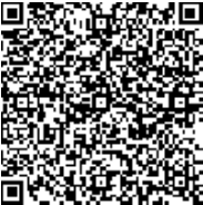
LIFT August 6th