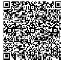
Biblical History Center Trip

Assistive Listening Devices are located in the narthex