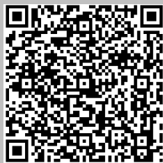
Holy Disciples Church

As we continue our annual focus on Stewardship of Treasure , we invite you to take a moment to reflect on the many ways God has blessed you financially over the past year.