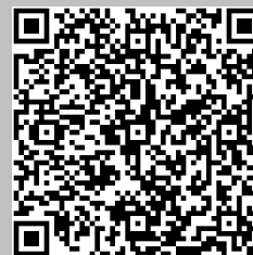
Our Lady of Good Counsel Church

As in previous years, your generous support directly sustains our mission and our ministries—helping one another encounter Jesus Christ in meaningful and transformative ways.