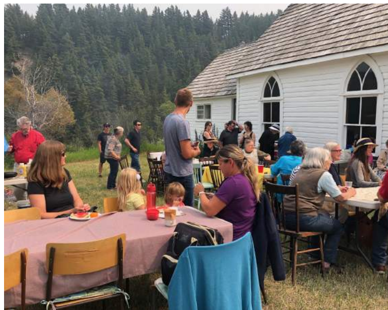
Mountain Mill Family Picnic