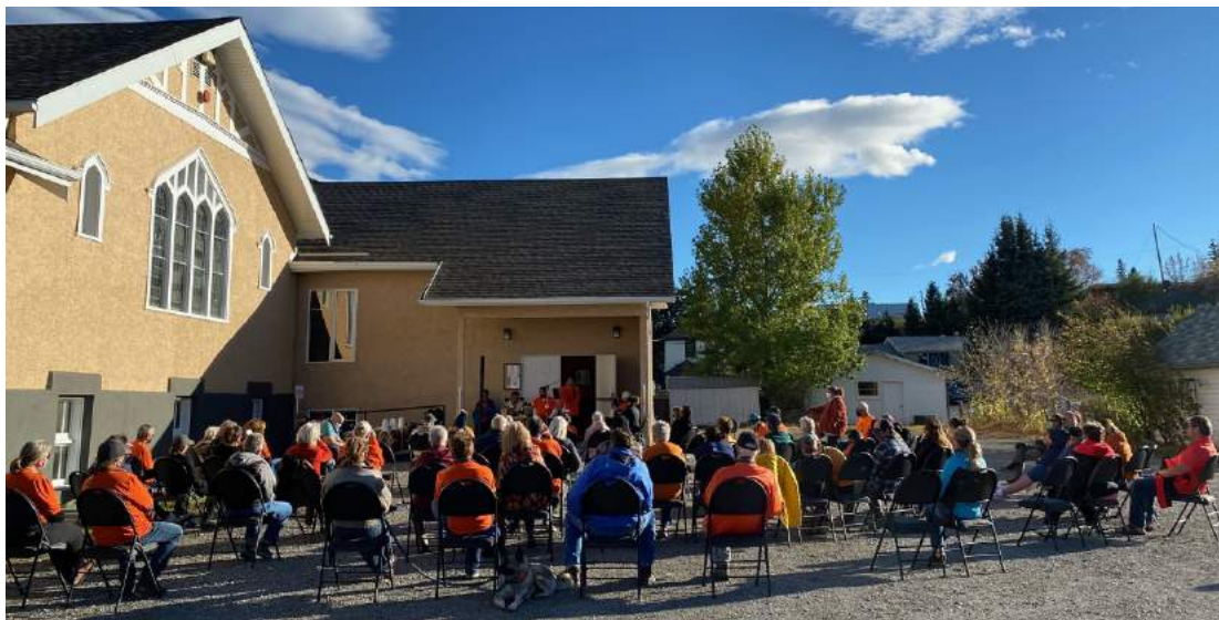
Truth and Reconciliation Service

“God, help us to treasure these moments of myst’ry; To hallow the Sacred in all that we do. Throughout ev’ry season may we be your agents Of love, joy, and blessing as hearts are renewed.”