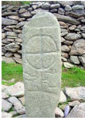
Early Celtic Cross

arms after hearing Pope Innocent III talk about the Tau symbol. The symbol represents resurrection, reincarnation, life, immortality, symbolic death, a gateway and general well-being. It is now used as a symbol of the Franciscan Order.