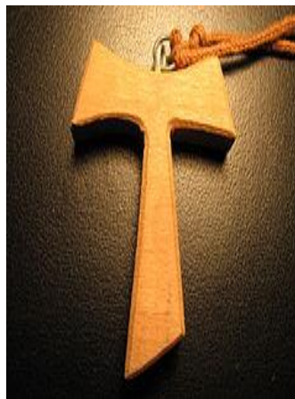
The Tau

A variation of the cross was used by the Assyrians as a symbol to represent their sky god Anu. A cross within a circle was and remains part of the sacred symbology of many North American Indigenous peoples. Variations have been found elsewhere in the world on archaeological sites dating back thousands of years. In a cave on Cuba's Island of Youth a curved cross was found carved into the rock wall. According to locals, it is the work of the mysterious 'sea people' of unknown origin.