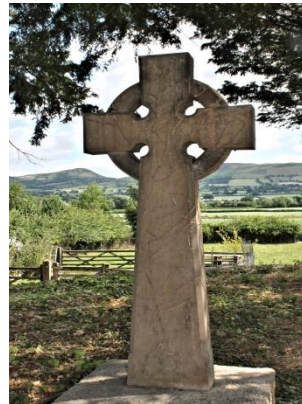
Later Celtic Cross

The Celtic cross is a symbol of both culture and faith. The true origins of the Celtic cross are unknown but there are many theories and legends. One legend says that the first Celtic cross was formed by St. Patrick while bringing Christianity to the Druids. The druids used to worship a large circular stone. St. Patrick, on seeing the significance of the stone, drew a large cross through the middle of it in order to bless it. From this act, the two cultures combined to form the Celtic cross. The cross represents Christianity and the circle is the Celtic representation of eternity.