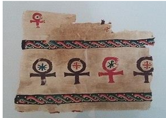
Coptic crosses (Creative Commons, public domain)

A variation of the cross was used by the Assyrians as a symbol to represent their sky god Anu. A cross within a circle was and remains part of the sacred symbology of many North American Indigenous peoples. Variations have been found elsewhere in the world on archaeological sites dating back thousands of years. In a cave on Cuba's Island of Youth a curved cross was found carved into the rock wall. According to locals, it is the work of the mysterious 'sea people' of unknown origin.