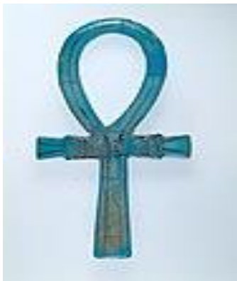
Ankh

This form was later adapted and amended by Coptic Christians so that the conical shape became circular, signifying the completeness and harmony of the Christ life. It has been found on cloth dating back to early Christendom. The circle sometimes contained the Chi Roh, the interlocking of the first two letters from the Greek word for Jesus.