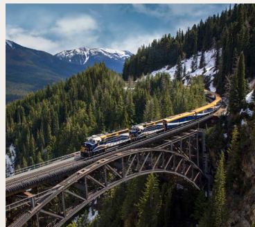
First Passage to the West