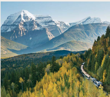
Journey through the Clouds