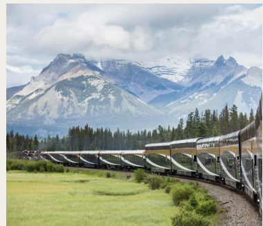
Passage to the Peaks

OFFER MUST BE APPLIED AT THE TIME OF BOOKING.