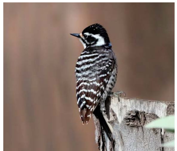
Nuttall's Woodpeckers.