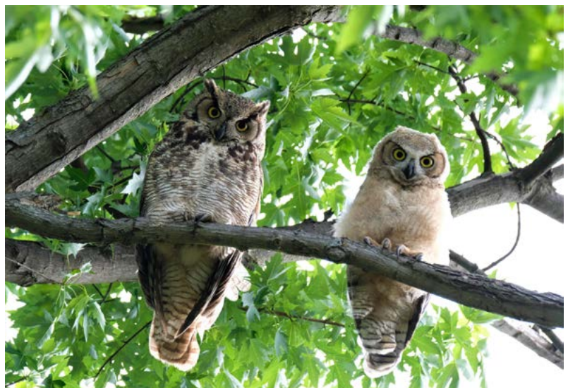
Great Horned Owl and owlet.