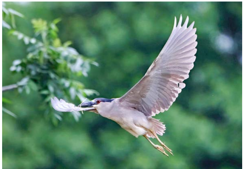
Black-crowned Night Heron.