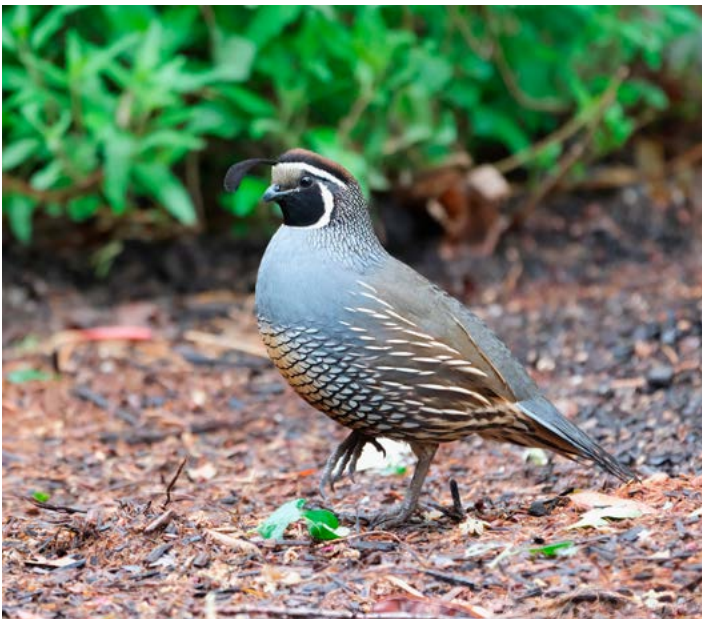
California Quail.