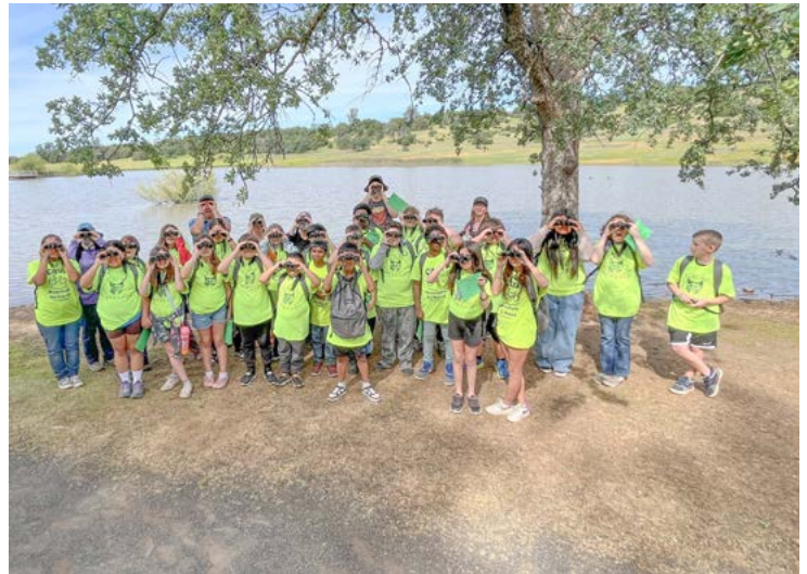
Bird trip with 5th grade students from Citrus Elementary School