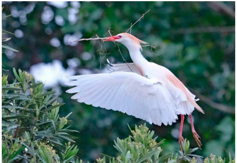
Cattle Egret.