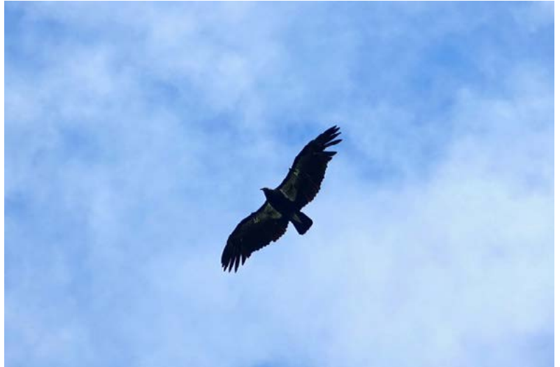
California Condor.

Accommodations: We will be camping at Elk Country RV Resort.