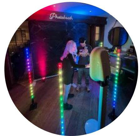
Photo Booth Package

With over 50 designs to choose from, you can find the best addition to your dance floor or have displayed on a specified area on your special day!