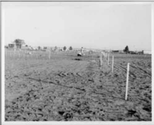
Figure 1 - Victory garden in Ontario, 1918

You may have heard of Victory Gardens, war gardens or defense gardens before. In 1917, during World War I, the Canadian Ministry of Agriculture campaigned “A Vegetable Garden for Every Home.” A record number of new small gardens were started across the allies. In WWII, less than 30 years later, Great Britain campaigned on “Digging for victory!” Both Buckingham Palace and Windsor Castle had vegetable gardens planted; so did the White House in the USA. Vacant lots, school yards, and public parks all became gardens. On both sides of the Atlantic garden clubs and county fairs sprung up as