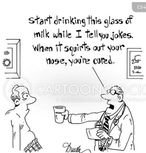
Laughter Is The Best Medicine