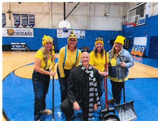
Hair Shave Day - Fun Run 2025