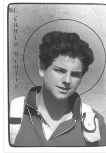
Blessed Carlo Acutis