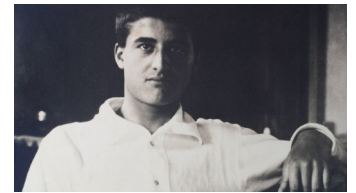
Blessed Pier Giorgio Frassati