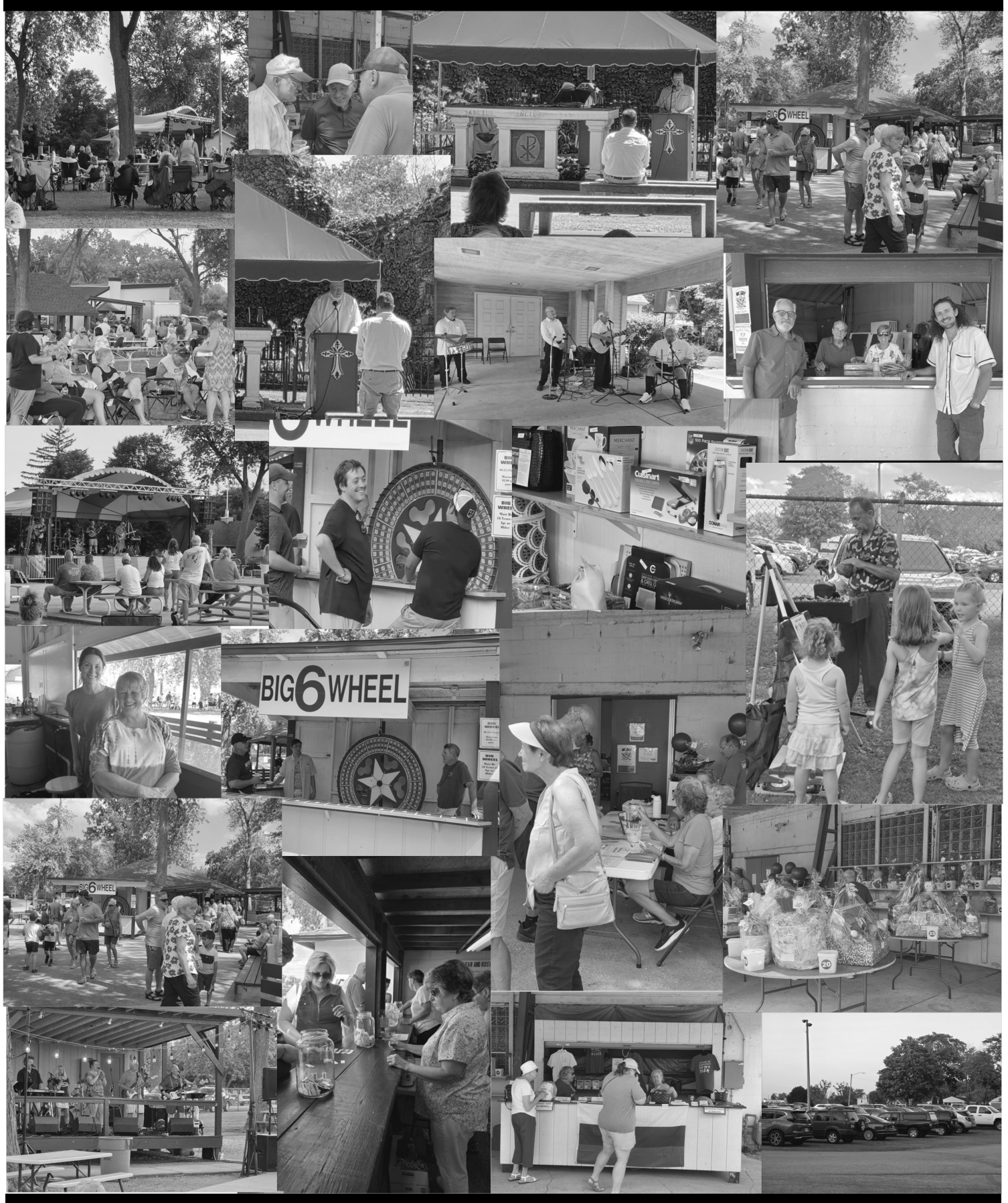
4 Page | St. Joseph Catholic Church