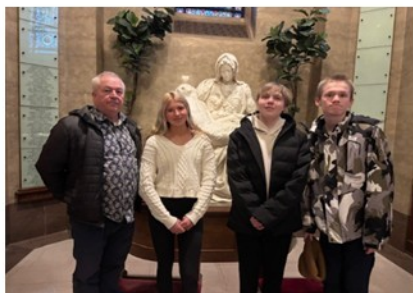
2026 Confirmation Class