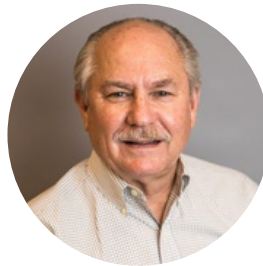
Ben Middlebrooks City of Rusk Mayor