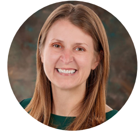
Kristen Ishihara City of Longview Mayor