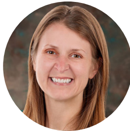
Kristen Ishihara Mayor of Longview