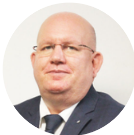
Kevin White Wood County Judge