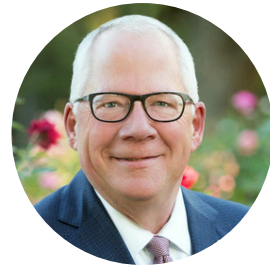
Don Warren Mayor of Tyler