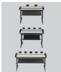
Your choice of scanner IQ Quattro X 44 inches HD Ultra X 42 inches HD Ultra X 60 inches