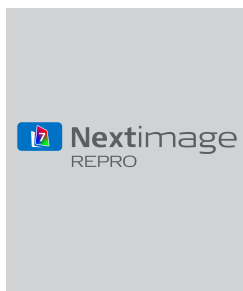
Nextimage Repro software