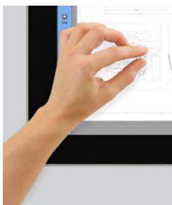
Touchscreen Full HD 22" touchscreen