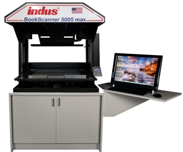
BookScanner 5005MAX with optional cabinet

Because the scanner is fast and can scan large format books and flat documents like 2 pages of a newspaper, engineering drawings and maps that may be very fragile and enables it to achieve high productivity.