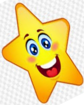
Quinton - Yr 5