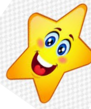
Remy -Yr 6