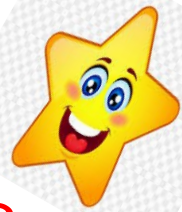
Oscar -Yr 1