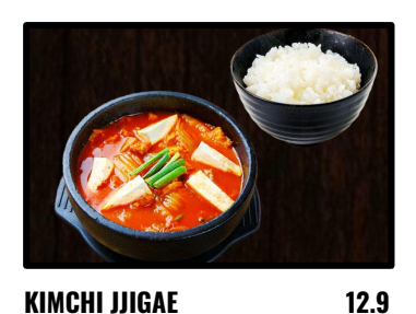
KIMCHI JJIGAE 김치찌개 🌋 🐠 🕪

Traditional mild tasting seaweed soup served with a bowl of rice