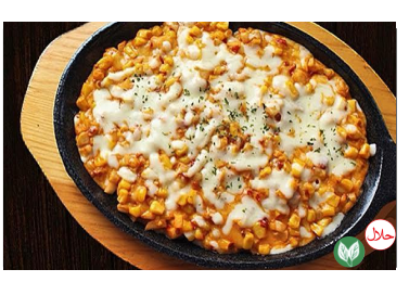
CORN CHEESE 콘치즈 9.5 Korean style corn with melted cheese (with mayo & veg)