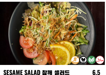
SESAME SALAD 참깨 셀러드 A side salad with house-made sesame dressing