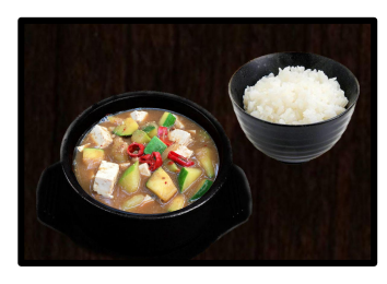
VEG. DWENJANG JJIGAE 된장찌개 🌋 🐼 😘 🕟

Kimchi stew soup with vegetables served with a bowl of rice *kimchi contains fish sauce*