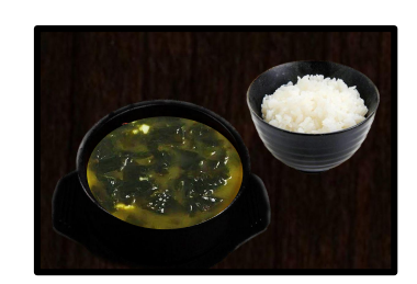
SEAWEED SOUP 미역국 🌋 🐼 🚳 🕟

** UPGRADE ALL SOUP TO A LARGER PORTION FOR 2.0 EXTRA **