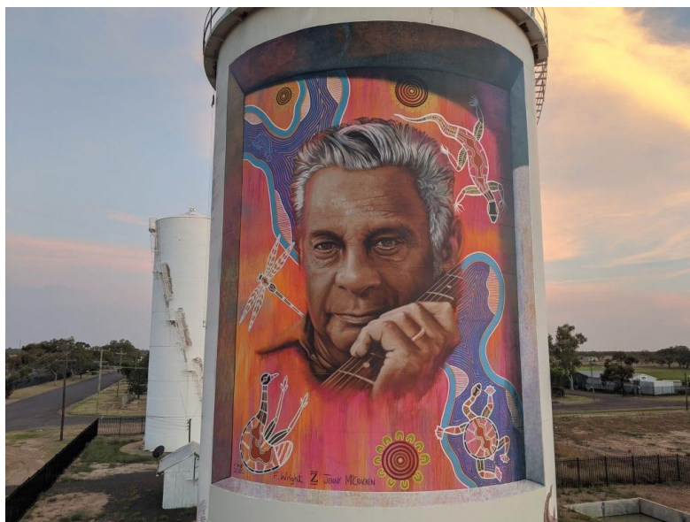
Walgett water tower mural of Jimmy Little

This Statement makes clear the role of our Joint Organisation in leading particular initiatives that support regional outcomes, but also identifies some of the local issues our member Councils are pursuing on behalf of their own communities which will be supported and advocated for by the FNWJO. We look forward to using this Statement to drive delivery of results for our regional communities across the Far North West.