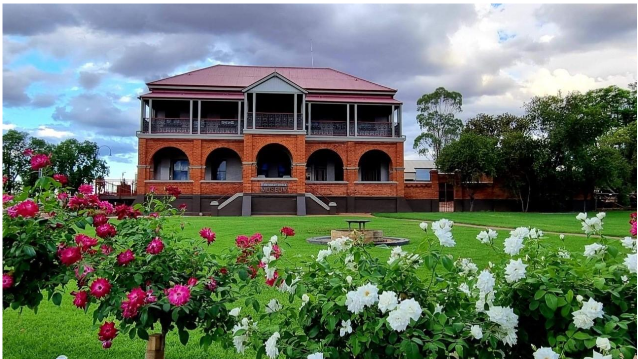
The Great Cobar Museum