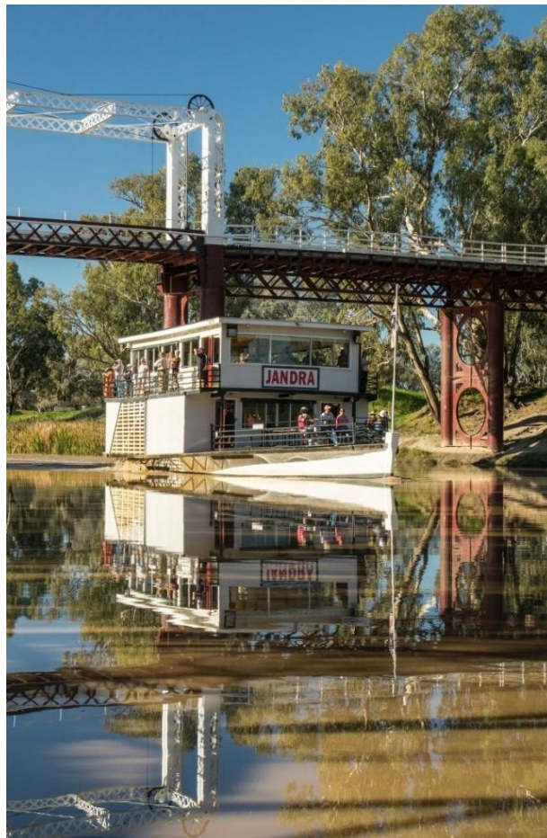
Jandra Paddle Vessel on the Darling (Baaka) River, North Bourke