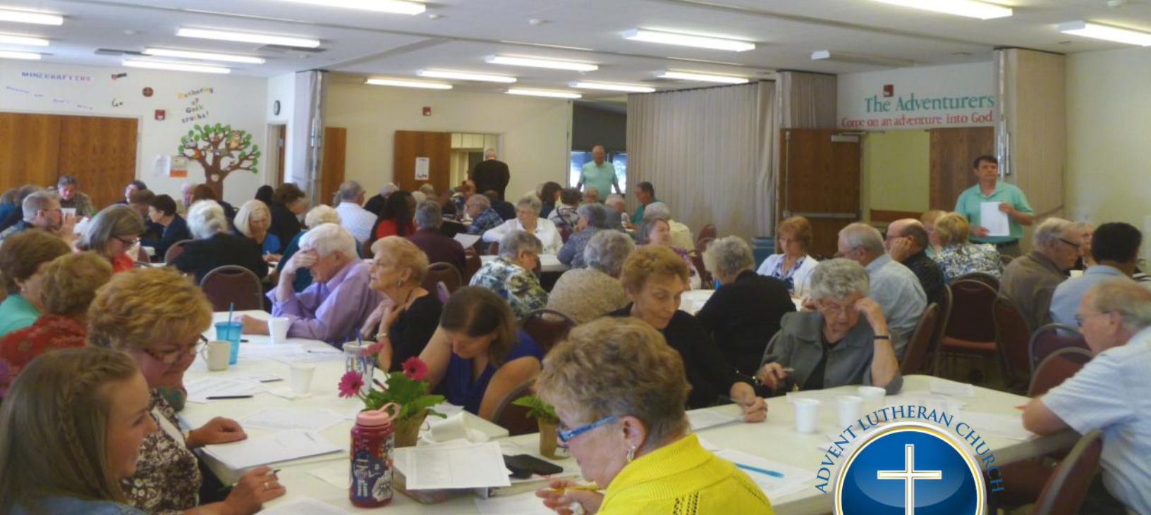
All church visioning meeting with Call Committee