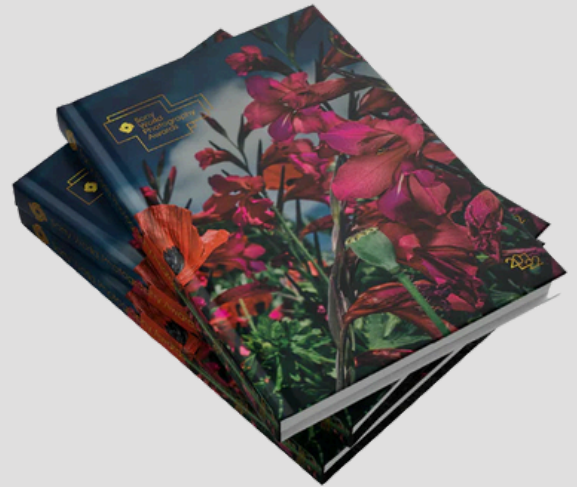
Fiesta on the cover of Sony World Photography Book, 2022