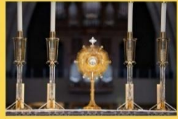
Offer One Hour of Adoration or One Work of Mercy

On June 11, 2026 , the bishops of the United States consecrated our nation to the Sacred Heart of Jesus. Parishes can participate in 250 hours of adoration together by offering a Holy Hour on a weekly or monthly basis leading up to the July 4 anniversary.