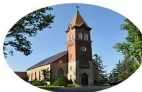
St. Wenceslaus 57975 Baer Ct Eastman, WI 54626