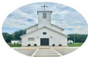
Sacred Heart of Jesus 711 East Main St. Wauzeka, WI 53826

Sacred Heart of Jesus and St. Wenceslaus combined website http://www.sacredheart-stwenceslaus.org