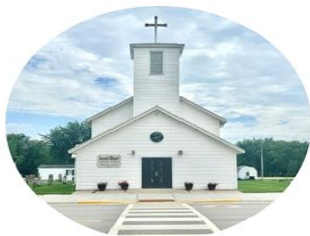
Sacred Heart of Jesus 711 East Main St. Wauzeka, WI 53826