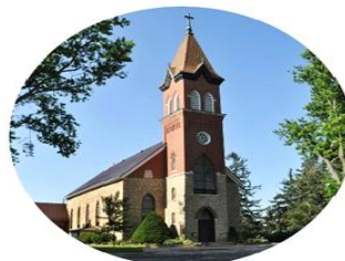
St. Wenceslaus 57975 Baer Ct Eastman, WI 54626