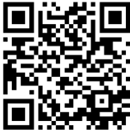
Williston Federated Church Christmas Eve Special Offering

Many of you have expressed concerns for our Afghan and Congolese friends, given recent pronouncements, policies, and proposals from the federal administration regarding refugees and immigrants. At the moment, there remains considerable uncertainty about what policies will go into effect, and how USCIS (U.S. Citizenship and Immigration Services) and ICE (Immigration and Customs Enforcement) will respond locally. Our desire is to help ensure the safety and well-being of these our fellow Vermonters.