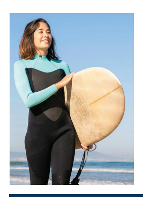
Super guarantee increasing to 12%... cont

This is great news for workers, because more super means more savings for retirement, and that can make a big difference later on.