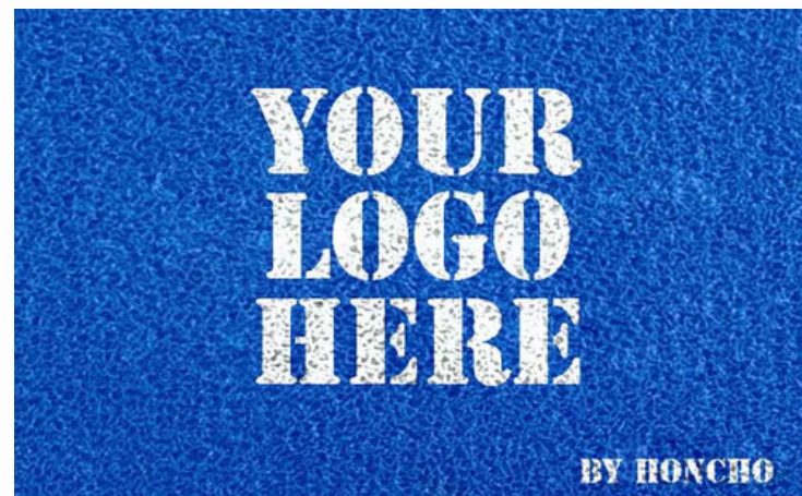
Boss Mat Door Mat (Custom) BMHDDM12x8-Custom