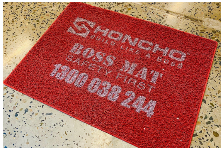
Boss Mat Door Mat (800x600mm) - BMHDDM8x6