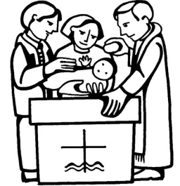
I baptize you in the name of the Father and of the Son and of the Holy Spirit