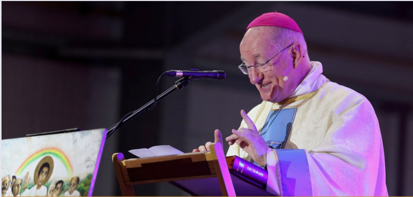
MASS OF THANKSGIVING