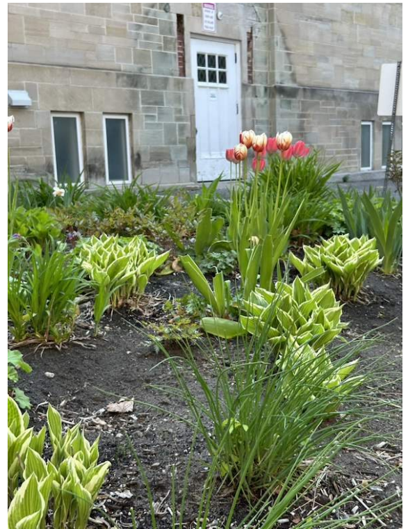
In a garden at St. Matthew's, first signs of growth in May 2026