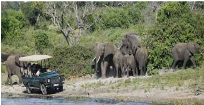
Chobe River, Botswana 4WD Safari