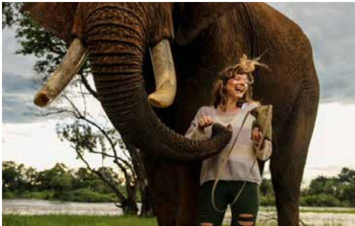
Meet the "Locals" Elephant Café / Evening Dinner - If you're not living life on the edge, you're taking up too much room