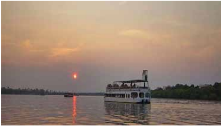
Zambesi Sunset Cruise