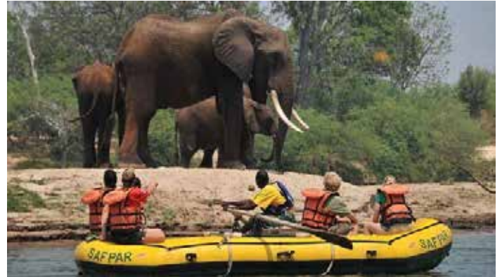
Zambesi River Raft Float Safari