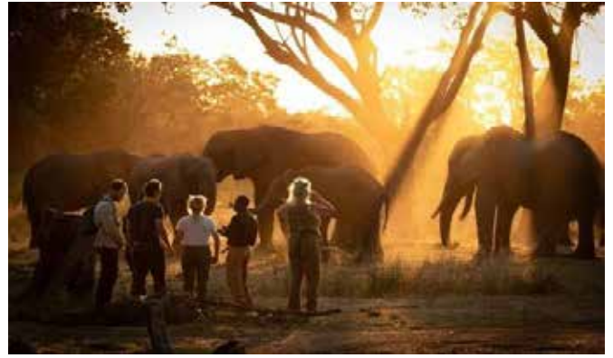
Sunset at the Elephant Cafe