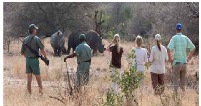
Walking Safari with Rhinos in Mosi-oa-Tunya Nat. Park