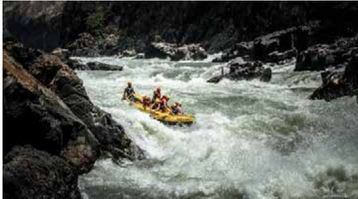
White Water Rafting the mighty Zambesi below the Falls