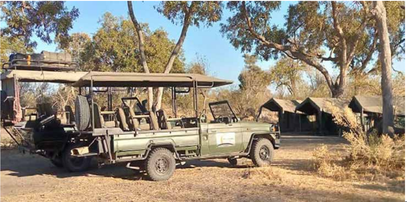
Pic above shows Safari 4WDs & Sahara Deluxe Tents in a typical camp site with shade trees