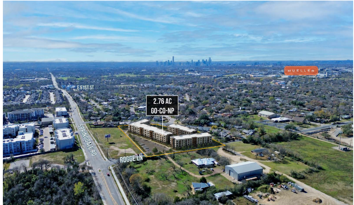
CONCEPTUAL SITE PLAN ONLY. NO REPRESENTATION OR WARRANTY IS MADE REGARDING ZONING, ENTITLEMENTS, OR DEVELOPMENT FEASIBILITY.