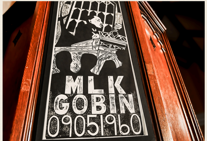
THE PULPIT MARTIN LUTHER KING, JR. PREACHED HERE IN 1960