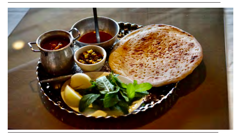
Kabob and Hot Bread (Nan-e-dagh va Kabob-e-Dagh) Two skewer of either beef, or chicken koobideh served with bread,

Dizi (Abgoosht) 22.99 Slow cooked lamb, tomato sauce