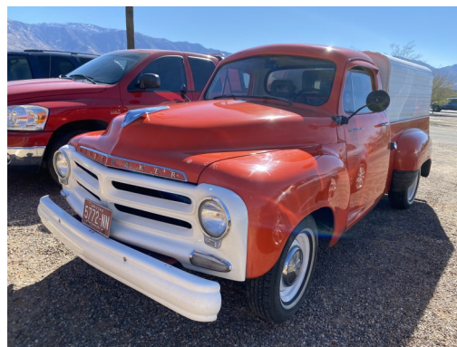
Lou Fencil's '56 Transtar