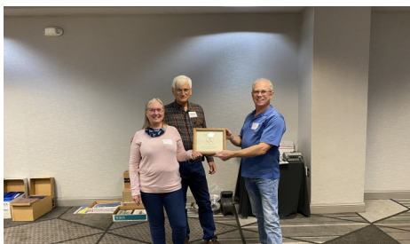
Members of the year award