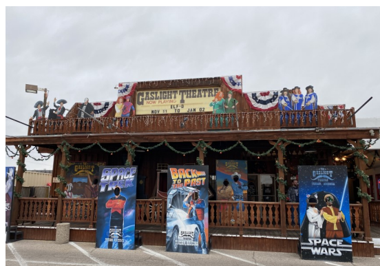
Now Playing: Elf'd

Editor's note: For those that have never been, the Gaslight Theater transports us back in time to a type of live presentation that no longer exists. It is known for raucous laughter, campy jokes, and outbursts of song. The audience is always encouraged to yell out "booooo" anytime the villain does or says anything bad, which always adds to the fun.