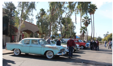
Checking out the classics