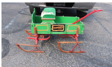
Studebaker Jr Goat Wagon