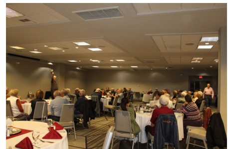
A perfect setting and delicious food