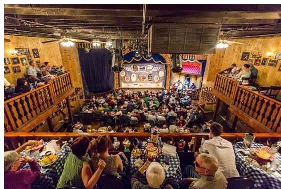
View from the upper balcony