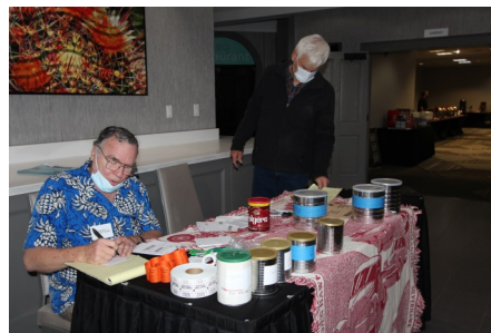
Ready to welcome guests