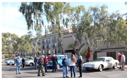
A beautiful day for a Studebaker gathering