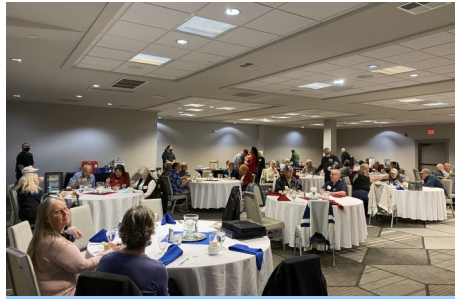
A perfect room for the event