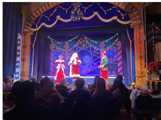
During the show