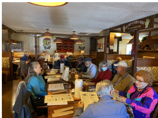
Plenty of room for a large gathering