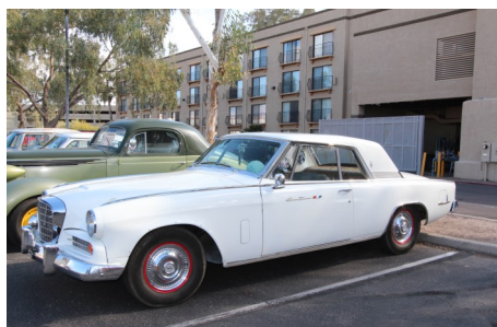
26 years separate these Studebakers