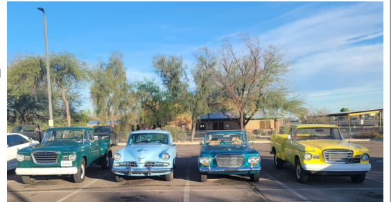
Ready to start the caravan