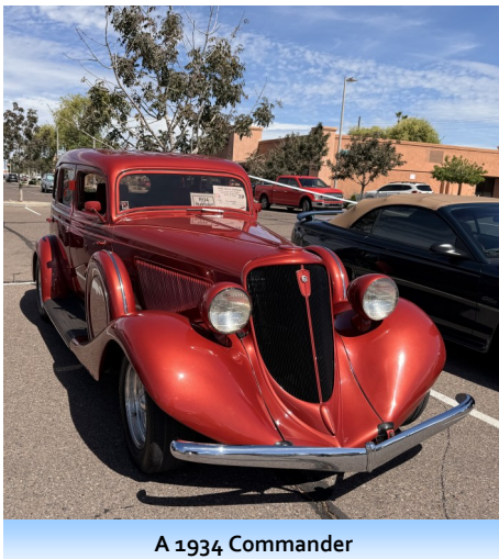
A 1934 Commander