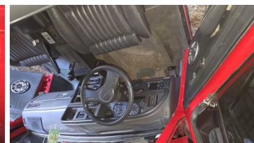
A '55 on a Thunderbird chassis