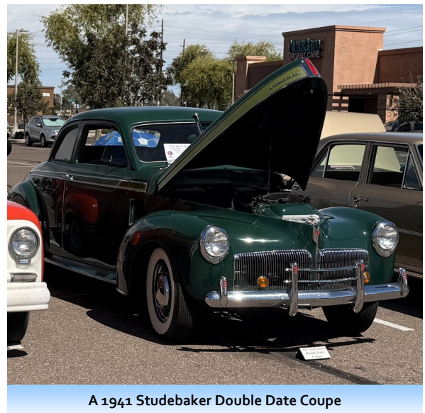
A 1941 Studebaker Double Date Coupe