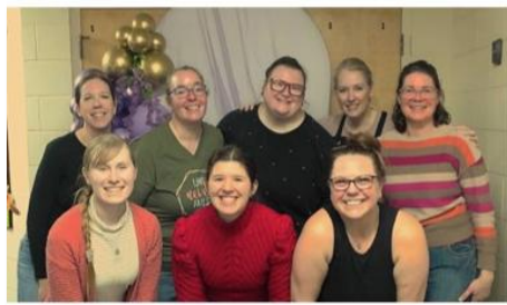
The Mary Circle

We all grew up admiring the dedicated women in our churches who made things happen; the ones who held our various churches together. In a similar way, we admired the women at Ezekiel who were doing the same. We wondered how we could become a part of this group of holy women. After doing a bit of research, we found out that these amazing women of our past and our present (including us!) were/are a part of "WELCA" (Women of the Evangelical Lutheran Church in America). We learned that Ezekiel has 4 Circles. Unfortunately, their meeting times are during the day. This posed a problem for us since we all worked during the day. But in a short time, we had a solution: we would start our own Ezekiel WELCA Circle.