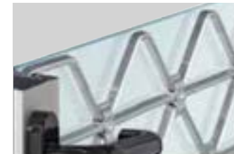
Optional additional synthetic panel to provide protection to exclude the possibility of reaching through