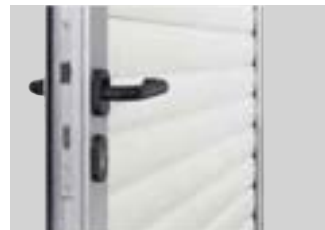
Lever handle set as standard