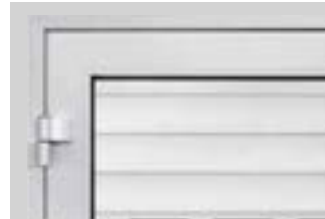
Viewed from inside with 3-way adjustable hinge