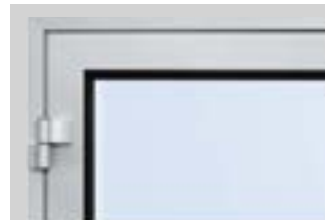
Viewed from inside with synthetic glazing