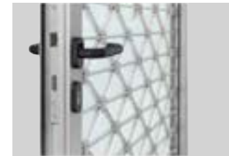
Lever handle set as standard