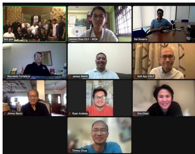
Group shot, virtual and live participants