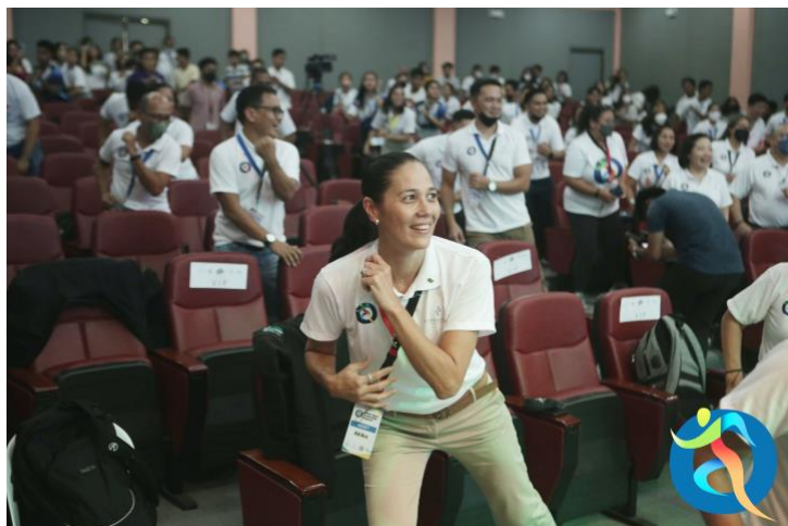
Zumba session led by OSLPians