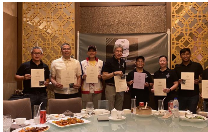
OLYs receiving their certificates