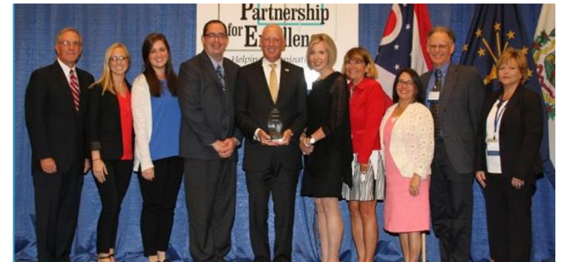
Six Disciplines Consulting Services, Findlay, OH