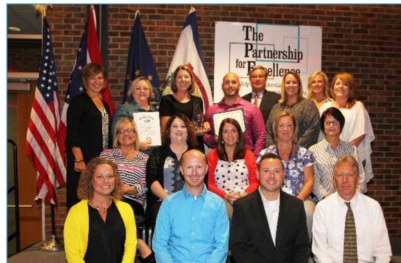
ProMedica Memorial Hospital, Fremont, OH - 2018