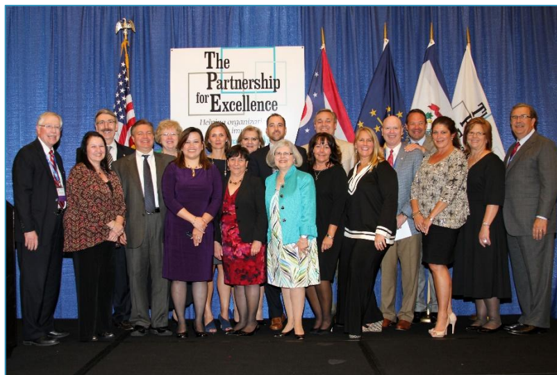
Charleston Area Medical Center Charleston, WV - 2017