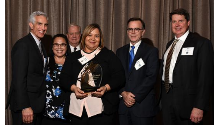
Illinois Municipal Retirement Fund, Oak Brook