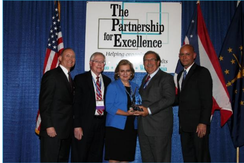
CAMC Health System, Charleston, WV