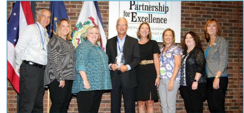
ProMedica, Toledo, OH