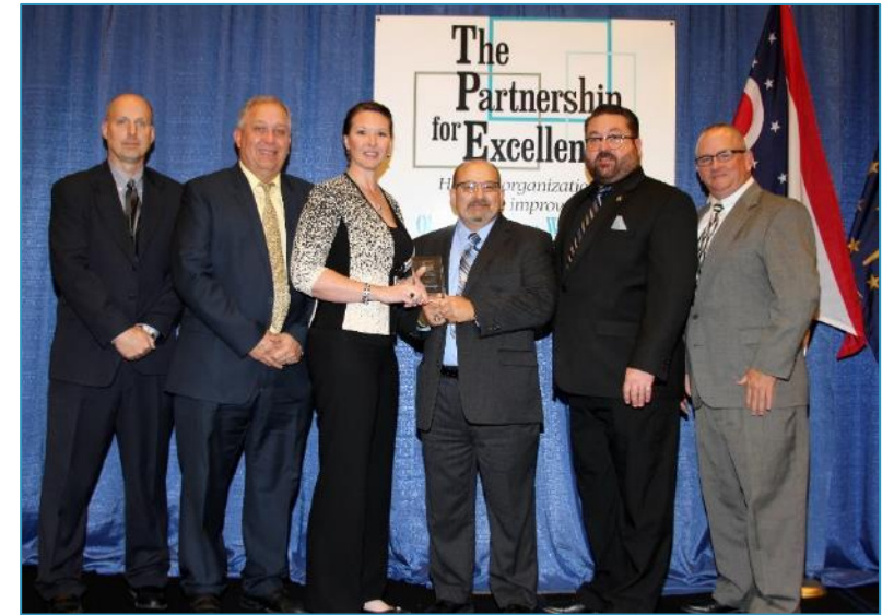
Braun Ambulance, Van Wert, OH