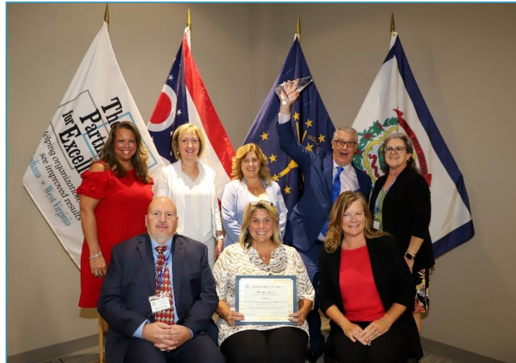
WVU Medicine Camden Clark Medical Center Parkersburg, WV 2022