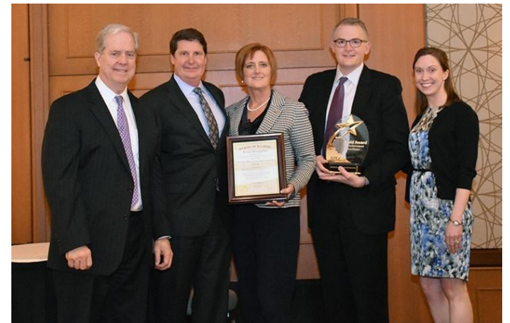
American College of Healthcare Executives, Chicago