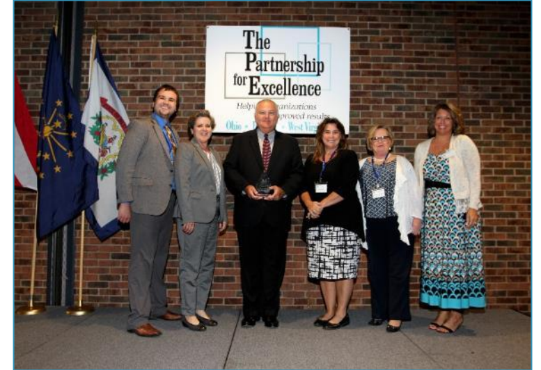
WVU Camden Clark, Parkersburg, WV