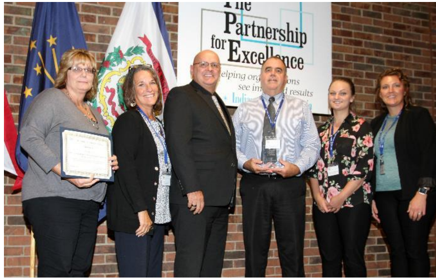
Perry County Board of DD, New Lexington, OH