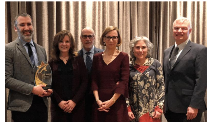
Integrated Project Management, Burr Ridge