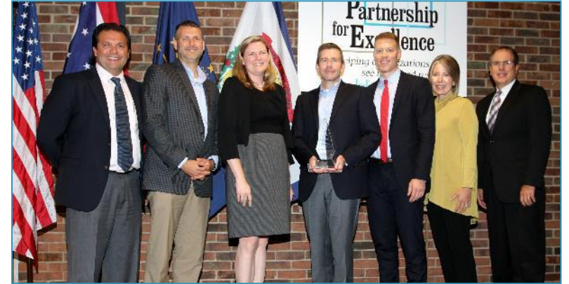
Managed Healthcare Services, Lilly USA Indianapolis, IN