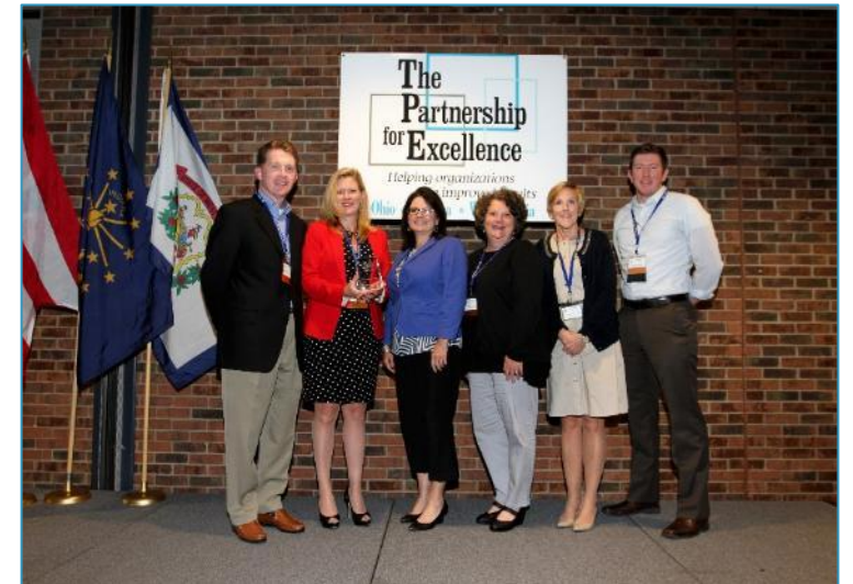
Mon Health, Morgantown, WV