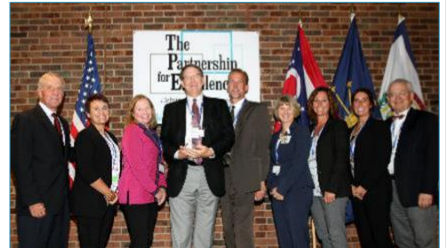
Blanchard Valley Health System, Findlay, OH - 2019