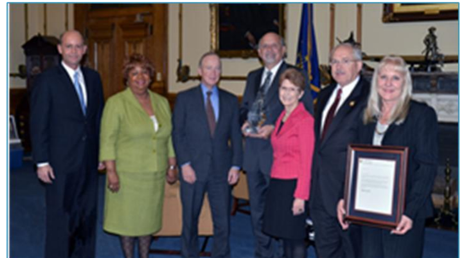
Citizens Energy, Indianapolis, IN – 2012