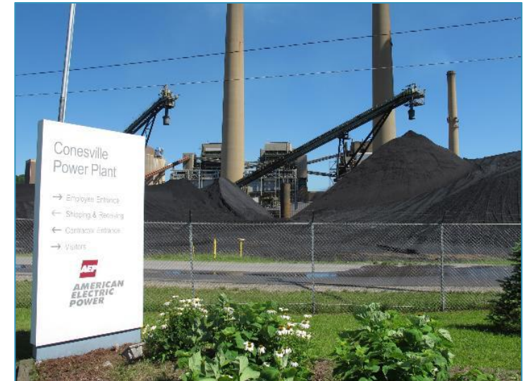
American Electric Power, Conesville, OH