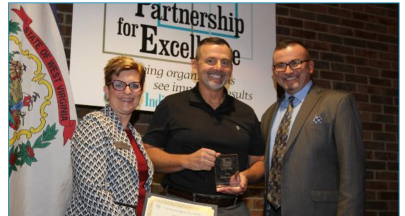
Clabber Girl Corporation – Spirit Award Terra Haute, IN