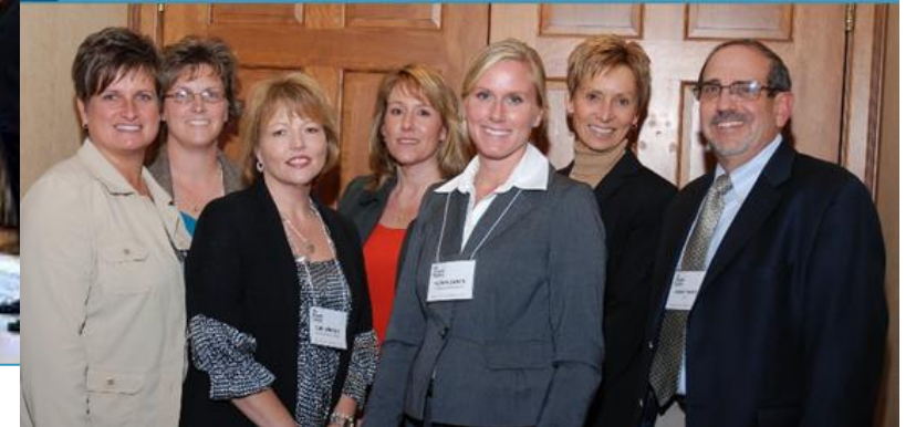
Schneck Medical Center, Seymour, IN - 2011