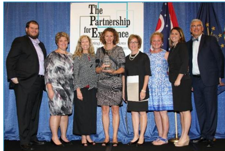
Memorial Hospital and Health Care Center Jasper, IN - 2016