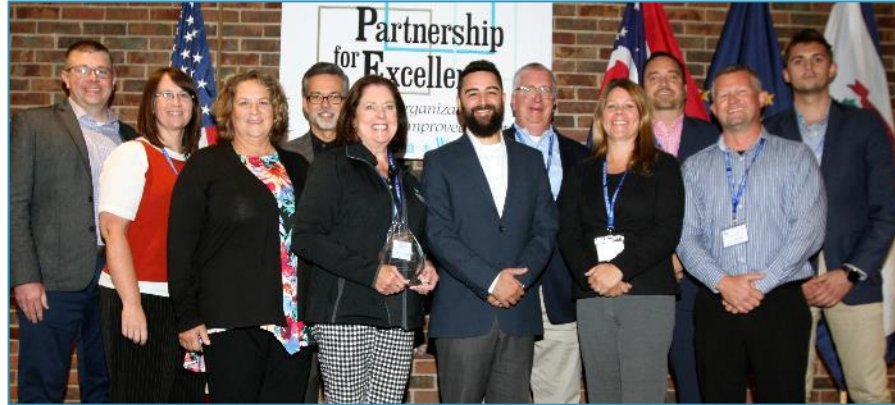
Hendricks Regional Health, Danville, IN