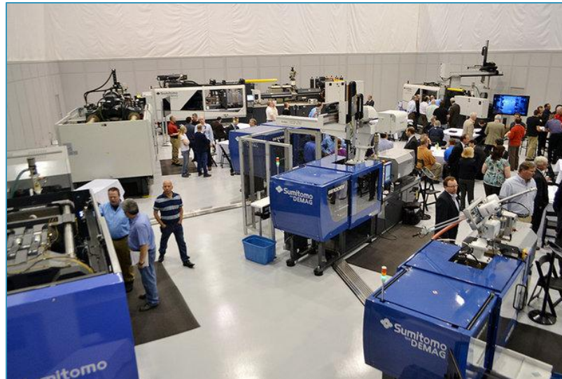
Van Dorn Demag Corporation, Strongsville, OH