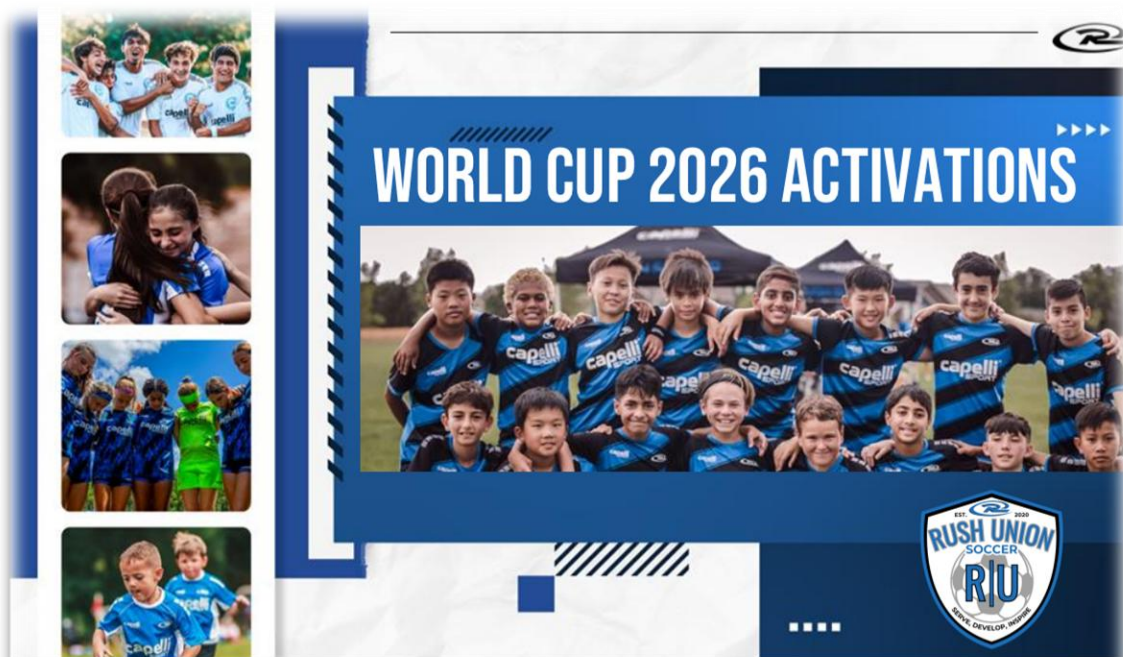
World Cup 2026 Activation